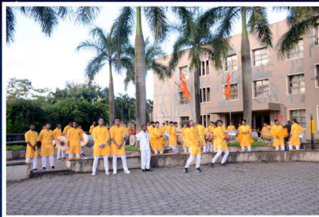
"Enthralling Dhol Tasha performance to welcome the dignitaries"