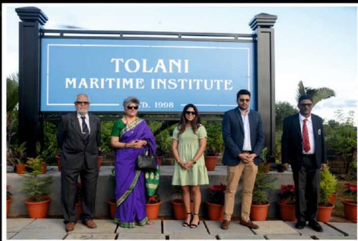
"Inauguration of Milestone name structure"